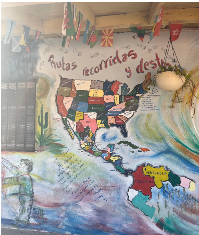
Mural at a Nogales shelter showing routes migrants traveled in the region to reach the US and their destinations.

Humanitarian aid workers in the United States and a northern Mexico shelter provider told us that organized crime violence and Mexican immigration enforcement have both increased in the small northern Mexico town of Sasabe, Sonora. One nonprofit organization employee who previously volunteered at a shelter in Sasabe has stopped volunteering because of "warlike" violence that broke out in the small town.