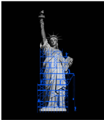
Illustration by Rebecca Chew/The New York Times