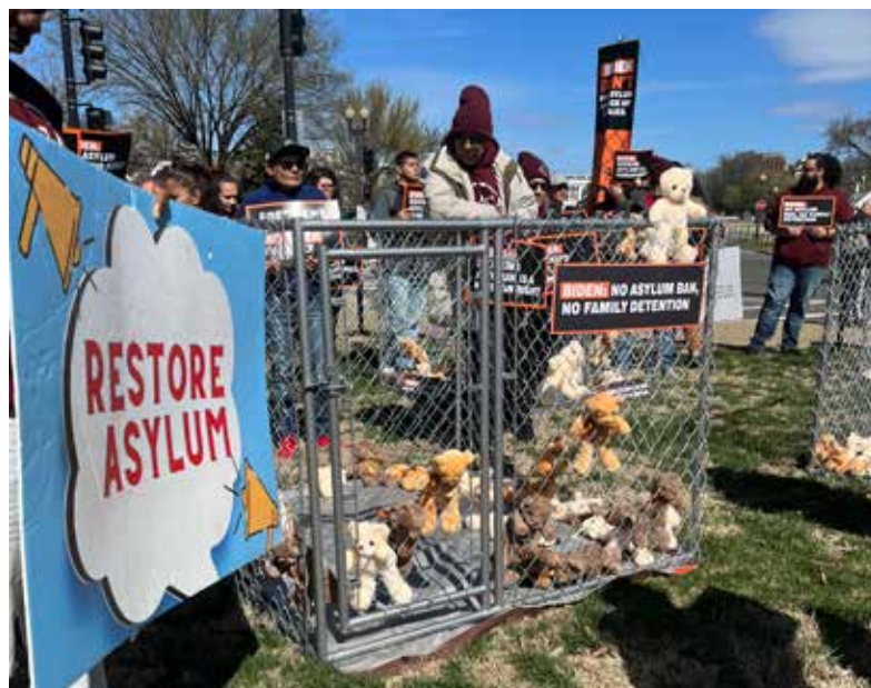
A rally in Washington, DC, organized by the #WelcomeWithDignity Campaign and partners.