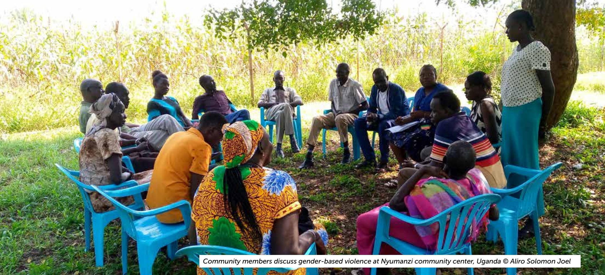
Community members discuss gender-based violence at Nyumanzi community center, Uganda