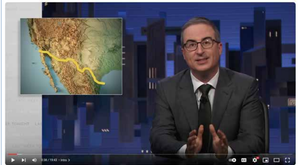
Biden & The Border: Last Week Tonight with John Oliver (HBO)

The writer is a policy adviser at the Women’s Refugee Commission.