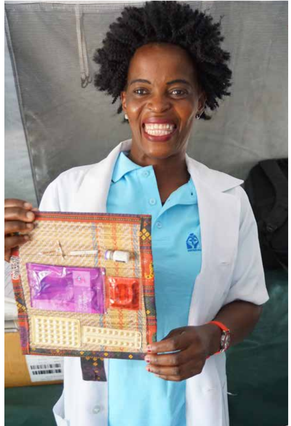
A health provider displays reproductive health IEC materials in a mobile health unit in the Mundruzi Resettlement Center in Mozambique.