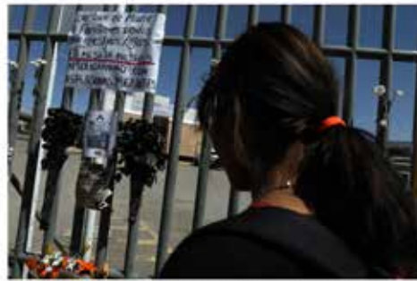
A woman looks at a sign in front of a fence at a migrant center in Tijuana, Mexico, on Wednesday, March 29, 2023.

Updated March 29, 2023 at 9:58 a.m. / Published March 29, 2023 at 7:26 a.m. EDT