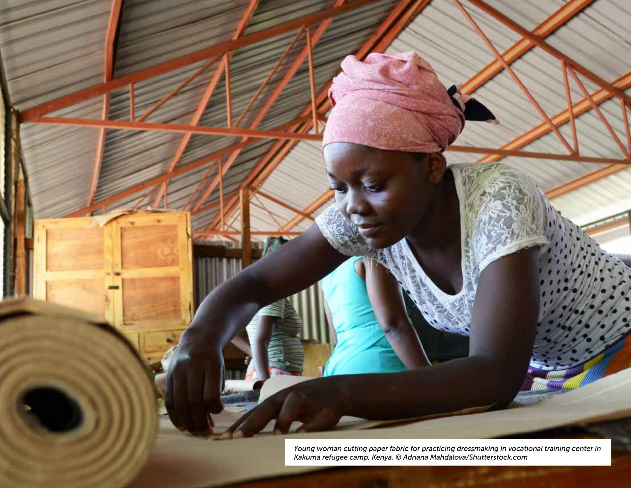
Young woman cutting paper fabric for practicing dressmaking in vocational training center in Kakuma refugee camp, Kenya.