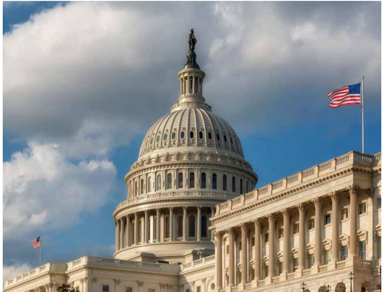
US Capitol, Washington, DC

As a result of our advocacy, two new US government policy initiatives include key measures to address gender-based violence in humanitarian contexts, including providing flexible funding to local organizations for gender-based violence response and reinforcing accessibility of comprehensive gender-based violence services to adolescent girls, people with disabilities, and LGBTQI+ survivors.