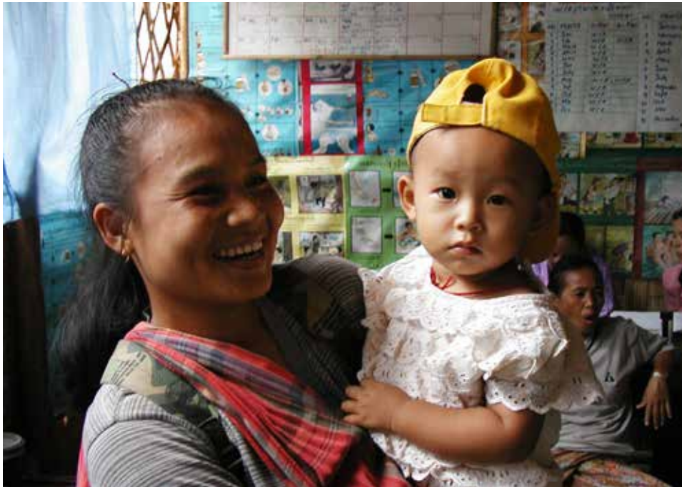
Maternal and newborn health is a key component of sexual and reproductive health in crises.

WRC co-founded and hosts the Inter-Agency Working Group on Reproductive Health in Crises, an international coalition of more than 50 organizations and over 4,000 individuals working to advance sexual and reproductive health and rights in humanitarian settings. The coalition develops guidance and provides technical assistance to frontline service providers, and advocates for adolescent sexual and reproductive health and rights, access to comprehensive abortion care, prevention and treatment of gender-based violence, maternal and newborn health, and health services for sexually transmitted infections, including HIV/AIDS.