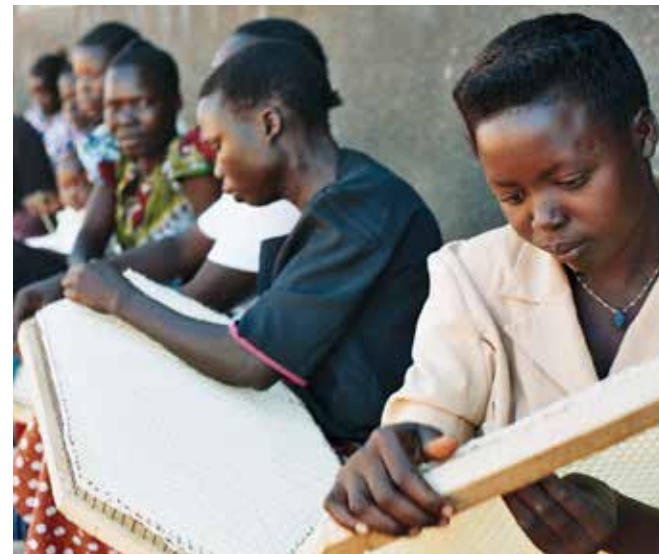
Young women participate in a livelihoods program in Uganda.

The Refugee Self-Reliance Initiative is a multi-stakeholder initiative co-founded in 2015 by the Women's Refugee Commission and RefugePoint. The Initiative supports refugee innovation, talent, and earning potential so that refugees can rebuild their lives. The Self-Reliance Index developed by the Initiative is the first-ever global tool for measuring the progress of refugee households toward self-reliance. The Self-Reliance Index is now being used by 60 organizations in 30 countries to measure the impact of their economic programs.