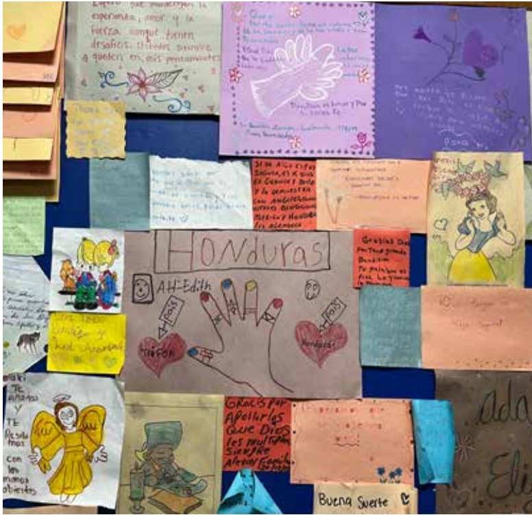
Drawings and notes from children seeking asylum at a San Diego shelter.