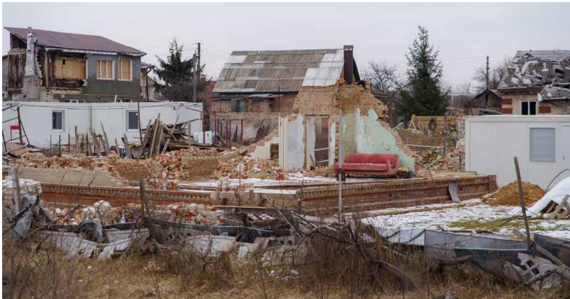
The destruction of homes in Ukraine, including these houses in Chernihiv Oblast that were destroyed by shelling, has caused massive displacement and decimated Ukraine's infrastructure.

The Women's Refugee Commission's groundbreaking report, Service Barriers Faced by Male Survivors in Ukraine , filled those gaps. Ukrainian humanitarian coordinators relied on our report to advocate for funding for more services to help all survivors of sexual violence in Ukraine including men and boys.