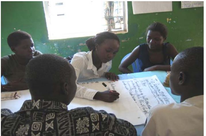
Youth from the Concerned Children Youth Association in northern Uganda stategize during a workshop with the Women's Commission.

Following that study the Women's Commission, in partnership with American Jewish World Service (AJWS), began working intensively with youth groups in the (continued on page 4)