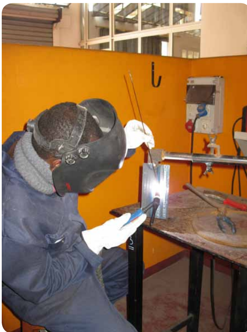
A refugee youth learns welding, a popular training option for work in the informal economy, at Don Bosco's Vocational Training Center.

Vocational training is needed and many youth interviewed requested access to this service; however, the availability, quality, timing and duration of vocational training needs to be improved. Training is currently offered through Caritas, which subgrants to 17 institutions across Cairo; however, only one institute was rated as effective by the people WRC spoke to. Don Bosco is the preferred training institute for Egyptian as