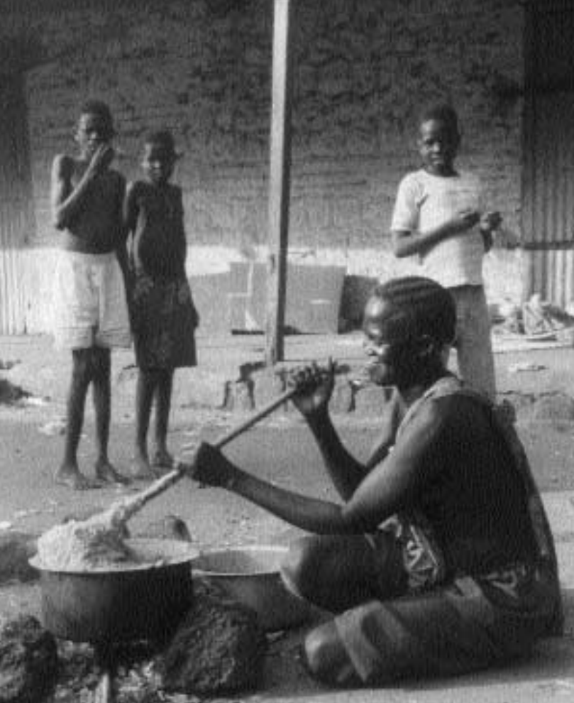
Women's Commission for Refugee Women and Children