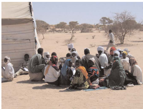
The refugee camps don’t have enough tents for classrooms, so often classes are held outside, like this class in Kounoungo refugee camp. Teachers in several camps said severe weather (heat, wind, cold, rain) keep children away from school. Some never return.

“We had to organize ourselves, to figure out the numbers of students who need school; then UNICEF would bring us the supplies, when we did this, they would bring blackboards and other supplies. The Minister of Education of Chad came. We started with school for those ages 10 and up. Then we made schools for children in P1 and P2. We did this, we made the education.” 68