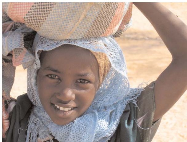
The refugee camps had few visible livelihood projects for adolescents who are not in school. Many teenage girls in the camps had little to do other than domestic chores.

There was very little for teenage girls to do in the camps other than domestic chores. There were no visible livelihood projects and secondary education did not exist. Even if it did, most girls were