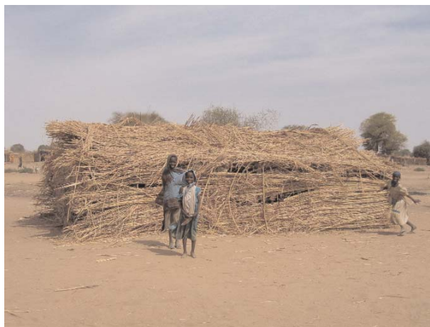
The community in Goz Amer refugee camp built structures out of straw for classrooms when much needed tents did not arrive. This area has more access to wood products than most of the other refugee areas.

In Djabal camp, Women's Commission staff met with a large group of teachers under a tree used as a classroom. They said that they had only three