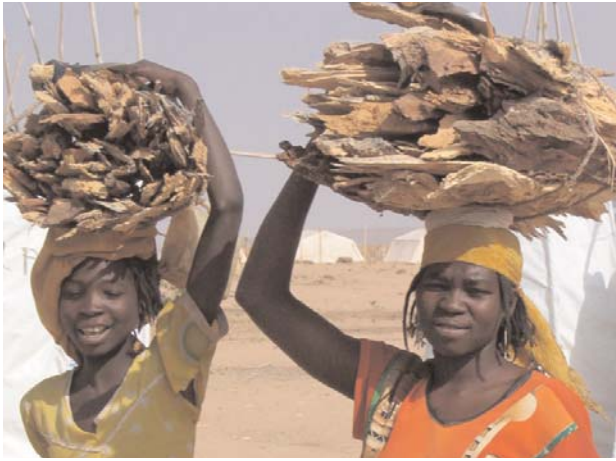
Refugee women and girls like these have to walk for hours to find firewood and are at times attacked by members of the local community who are concerned about dwindling resources. Cases of rape and other violence have been reported in many areas.

In most of the camps visited by the Women's Commission, girls and women had to walk for at least one hour to gather wood; many reported having to walk two or more hours each way. Gathering wood took at least one to two hours by the time it was found, chopped and bundled; girls and women often needed to collect wood two or three times a week. When girls are sent to collect wood, they miss at least a day of school.