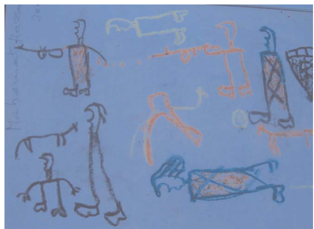
Children in Bredjing refugee camp drew pictures of what they saw in their villages in Darfur. Many of the pictures were similar to the one above.

CORD is developing a psychosocial program that begins by gathering youth to make traditional toys. After the children work for a few weeks on the toys, the program director begins to talk with the youth about their villages. She also shares stories of her life in her home town. The children then begin drawing pictures of their villages. The pictures contain images of planes dropping bombs, soldiers shooting people and fire. CORD