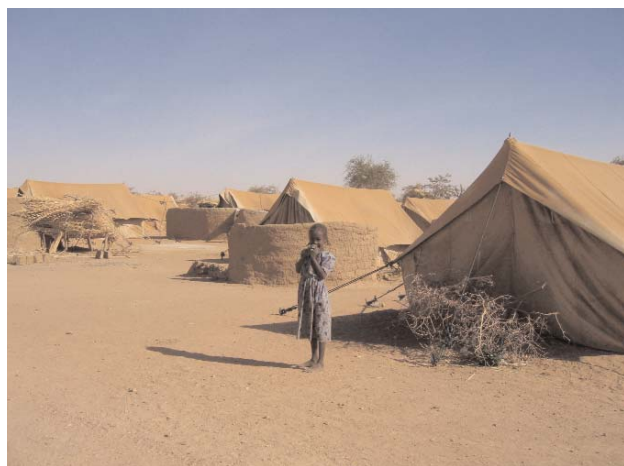
The harsh climate in eastern Chad makes a difficult life for refugees even harder. Water and firewood are scarce and temperatures fluctuate from extreme heat to cold. Sandstorms and heavy rains also present a challenge. This young girl lives in Kounoungo refugee camp.

The 11 refugee camps in eastern Chad lie along almost the entire length of the shared border with Sudan. In the north, around Bahai and Iriba, people have settled in the desert with few trees, a lack of arable land and little water. People in camps in the south of the country, near Goz Beida, fare a bit better than those in the north. They have greater access to water and it is possible to grow crops on small plots. 15