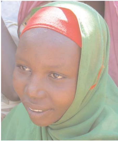
This refugee woman, 19, didn't go to school in Sudan, but says she would like to start in the camp. "We didn't know education was good for us women before we came to the camp. Now we know," she said.

Literacy classes were usually held in the mornings or evenings to accommodate the daily chores and were primarily oriented toward adults. Many of the adolescent married women who could not or did not attend school attended literacy classes. 94 In addition to basic literacy, some of the classes also taught numeracy and Islam. 95 CARE encouraged literacy classes in the camps where it was operational.