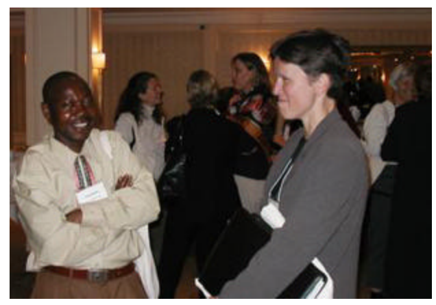
The conference provided good opportunities for networking.

To review selected PowerPoint presentations and photos from the conference and access new RHRC Consortium publications, please visit the RHRC Consortium website at <a href="https://www.rhrc.org">www.rhrc.org</a>.