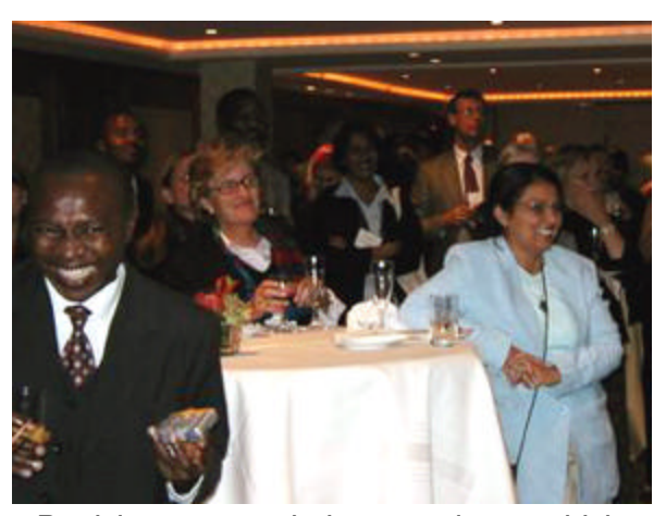
Participants attended a reception at which the Consortium announced its new name and launched new publications.

Global Decade Report, the third in a series of reports documenting the progress of providing reproductive health to conflict-affected populations, and Renewing International Commitment to Reproductive Health for Conflict-Affected Populations, a review of the Consortium's work over the last eight years of collaboration and a description of the group's focus for the future. In addition, the Consortium released new versions of important field-based training and awareness-building modules, including Raising Awareness for Reproductive Health in Complex Emergencies: A Training Manual and Moving from Emergency Response to Comprehensive Reproductive Health Programs: A Modular Training Series.