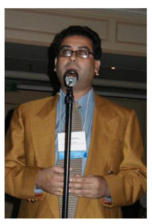
Participants asked questions during panel presentations.

training and assistance in some settings, less effective and more dangerous sharp curettage is still used in other settings. In addition, PAC frequently does not include timely family planning counseling, essential to preventing additional unwanted pregnancies. The establishment of standard protocols for PAC is urgently needed in all conflict-affected settings. Training and technical assistance for health providers in the use of standard PAC protocols must be undertaken to increase conflict-affected women's access to good quality PAC to prevent maternal deaths.