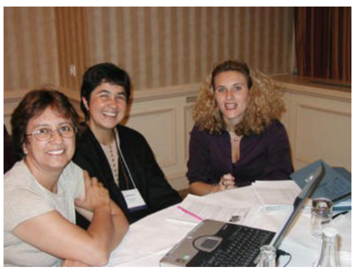
Presenters had an opportunity to practice the day before the conference.