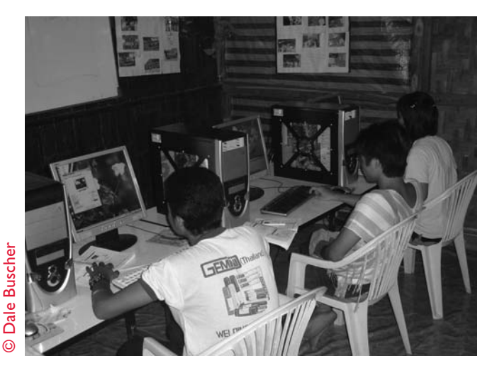
Burmese refugees in Thailand receive computer training.

The Women's Commission is embarking on a new project to help the humanitarian community develop and implement more effective livelihood programs (continued on page 5)