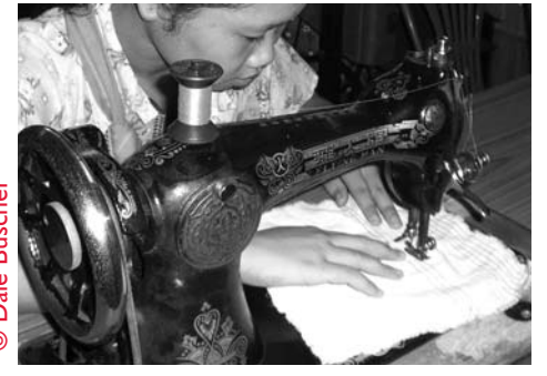
Skills learned in tailoring classes will help women like this Burmese refugee in Thailand earn a living and provide for themselves and their families.

targeting displaced women and adolescents, male and female. The program began in May 2006 and will run for three years. The Women's Commission will produce a comprehensive field manual aimed at donors and practitioners. The manual will review all livelihood activities, contain tools and