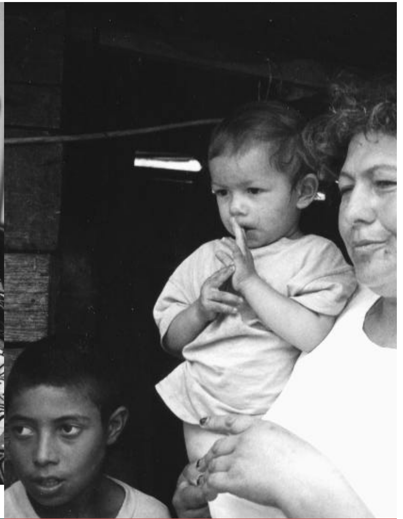
Women's Commission for Refugee Women and Children