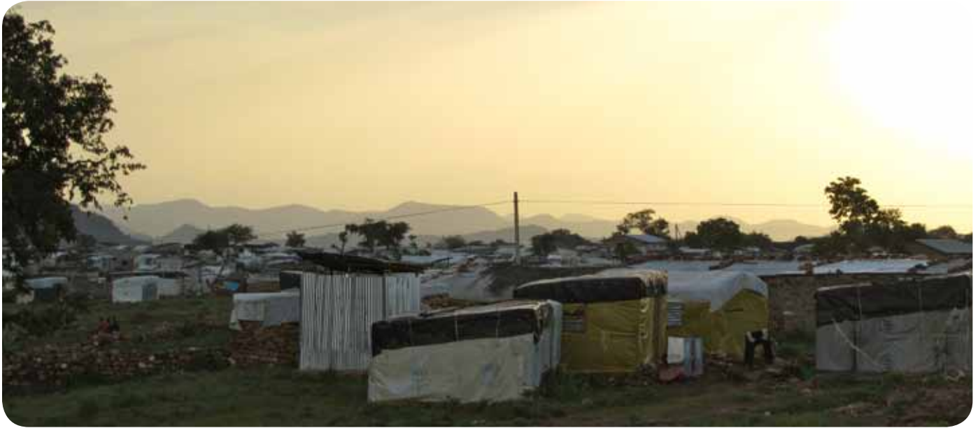
Mai Aini camp at dusk.

urged social justice, liberal democracy, human rights and a free market economy (Tronvoll, 2009). The nation rejoiced as a new Constitution was drafted.