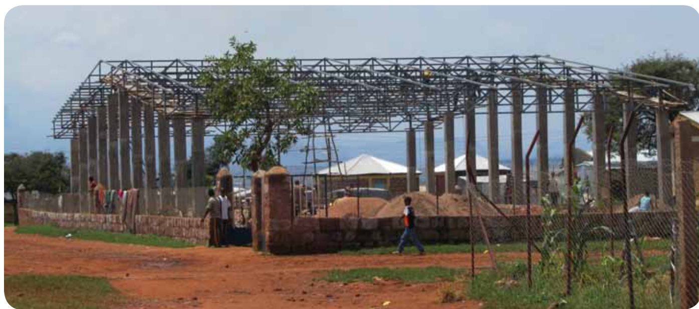
JRS sports and social center under construction in Mai-Aini Camp.

Shagarab I refugee camp in eastern Sudan has accommodated a steady flow of around 150-200 UASC per month over the past four years. The transient nature of the population means that they do not stay longer than a matter of months in the camp, and as of October 2012, only 77 UASC were registered in the two UASC centers. In 2012, 406 UASC were registered, while approximately 600 UASC have been verified by UNHCR in the refugee camps and urban areas in eastern Sudan ; however, the majority of these are presumed to be separated children living with relatives, as well as orphans from the protracted caseload.